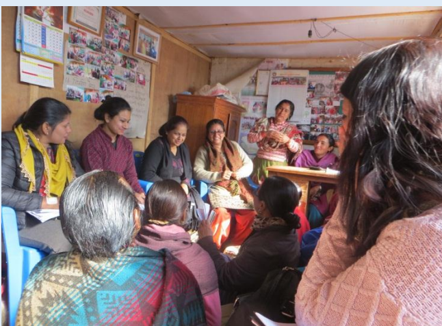
Similarly, during the field visit in Kathamndu, women of Dalit communities in Jorpati, Gokarneshwor VDC-15 & Gothatar VDC-11 were interviewed