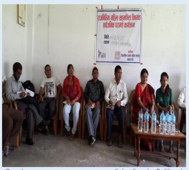
Oneday program on women participation in Politics in Nawalparasi