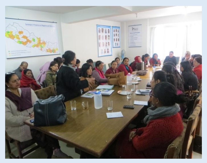
for other remaining focused districts.

The main objective of the orientation was to orient about tools and